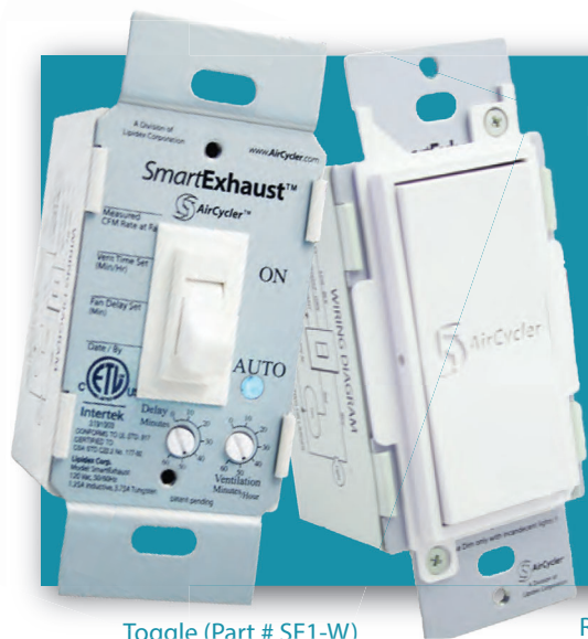
Toggle (Part # SE1-W)

The SmartExhaust™ Bath Fan/Light Switch is a simple and efficient solution for achieving adequate bathroom ventilation and meeting exhaust ventilation requirements. The SmartExhaust™ is designed to replace the bathroom fan and light switches with one smart controller and features programmable settings for running the exhaust fan as much or as little as you want, automatically.